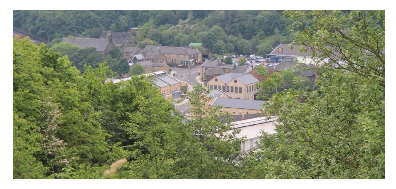
The Toposcope (7): St. Matthias Church, Stocksbridge Town Hall, Fox Valley and Lidl can all be clearly seen

We walk from Stocksbridge Town Hall up Hunshelf Bank to the disused Isle of Skye Quarry. The route then crosses fields before passing through mature woods as it drops down to the River Don and the Tin Mill ponds. We return to the Town Hall via Ellen Cliff and the Ford Lane path skirting <u>Fox Valley</u>.