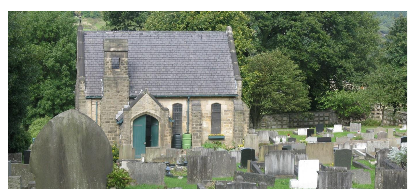
Birtin Cemetery, as seen from (16)

This circular walk takes you from Oughtibridge via Beeley Wood, Middlewood, Worrall, Birtin Cemetery and Sensicall Park before returning to the start point