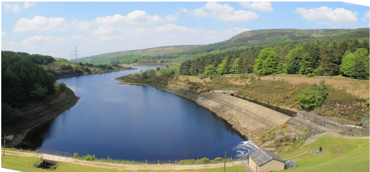
Rhodeswood Reservoir (8)

Starting from the car park, we head northwards onto moors, before looping back to cross the A628. A circuit of Rhodeswood Reservoir is then followed by the north side of Torside Reservoir before returning to the start.