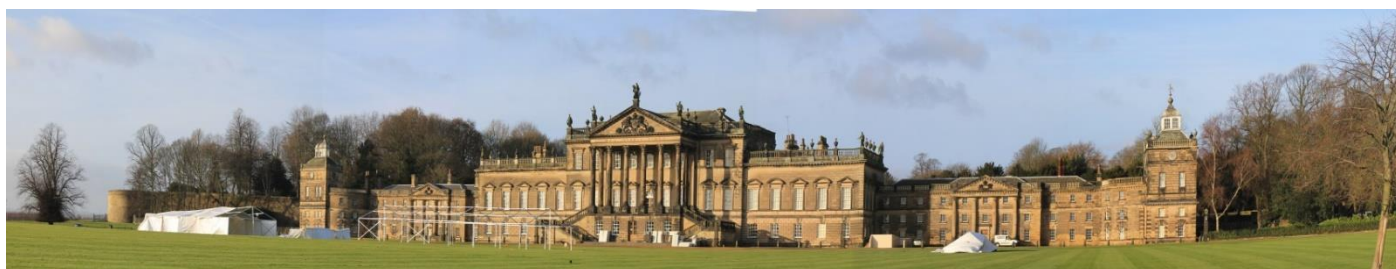
Wentworth Woodhouse before the commencement of restoration (11)

Description - This walk has plenty of variety. From Elsecar, we pass through woodland before reaching the first of a number of follies. We then circumnavigate parts of the Wentworth Woodhouse estate, passing through a landscaped deer park before returning to Elsecar, via woods. Wentworth Park has both Red and Fallow Deer. The deer give birth in June/July. The rut starts in October and the stags can become protective of their herds at both these times.