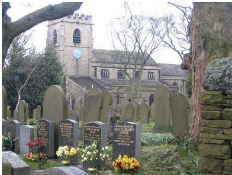
St. Mary's church was built 1872-79. The Lych Gate was erected to commemorate the Jubilee of Queen Victoria (1897) with the present gates commemorating the Silver Jubilee of Queen Elizabeth II (1977).

Bolsterstone originated as an Angle-Saxon settlement. The name may be a corruption of Walder, a local Saxon Chief. Alternatively, it may be derived from the existence of two huge stones now situated in the churchyard, generally known as 'bolster stones.' They were brought into the churchyard for safekeeping in the 19 th . Century. Archaeological records state that the twin mortise holes in the upper stone may have supported twin Anglo Saxon crosses. Local legend gives the stones as either the base of a gibbet or part of the structure for some other means of execution.