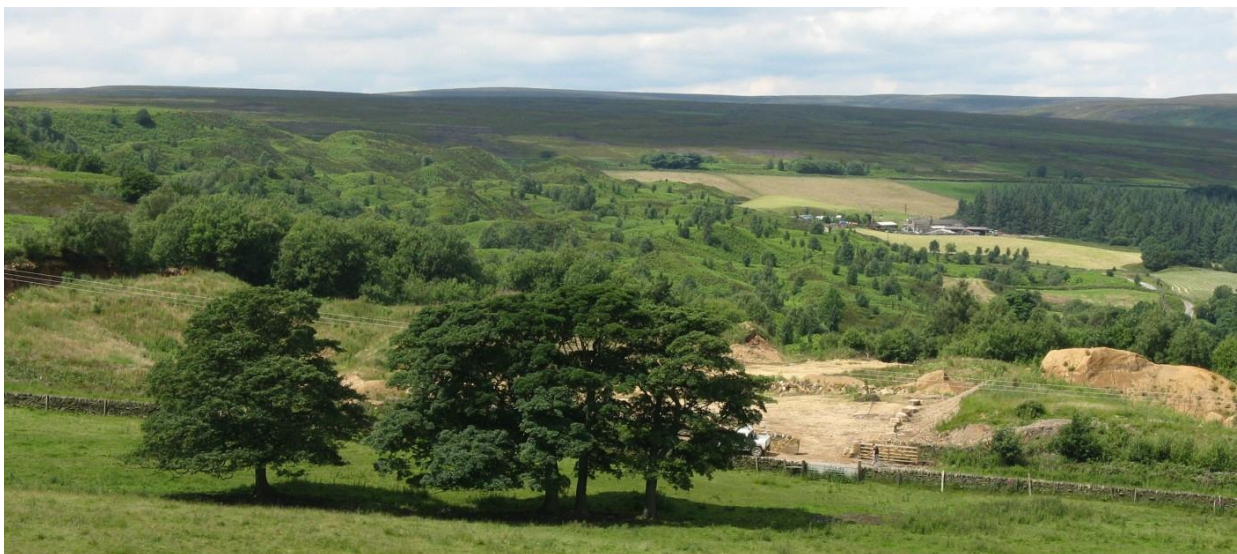
The Canyards (

From Bolsterstone the route descends towards Broomhead Reservoir before climbing towards The Canyards and distant views of the Peak District. We return via White Lee Moor and Broomhead Reservoir before ascending to Bolsterstone.