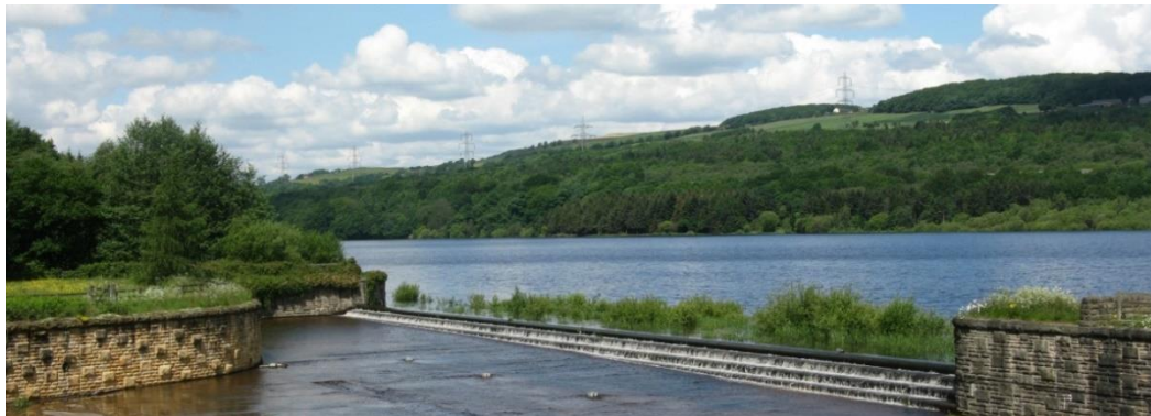
Underbank Reservoir (1)

This walk takes you past three reservoirs, taking in farmland, woodland and a disused railway line. It starts by following Underbank reservoir before a climb up to Midhope. Excellent views across the valley are afforded before the route drops down to the River Porter and then up to Langsett. We return to Underbank along the line of the railway that was originally built to supply materials during the construction of Langsett Reservoir between 1889 and 1905.